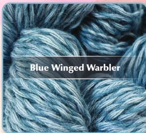
Blue Winged Warbler

70% Baby Alpaca, 30% Tussah Silk, spun with 100% Cashmere